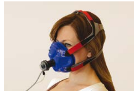
Alternatively to the canopy hood, REE can also be measured on spontaneously breathing subjects using a multi-use silicone face mask (5 sizes available)