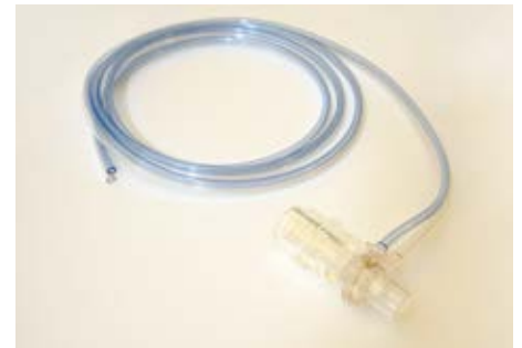
Disposable flowmeter (Flow-REE) inserted at patient's circuit during testing in ICU settings