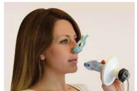
An antibacterial filter can be used when testing subjects with high risk of cross contamination